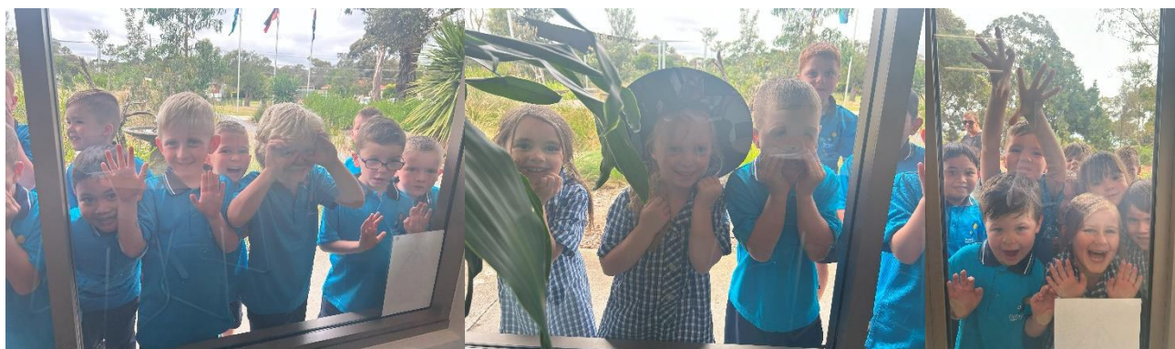
The Preps are desperate to get in and start their primary school journey!